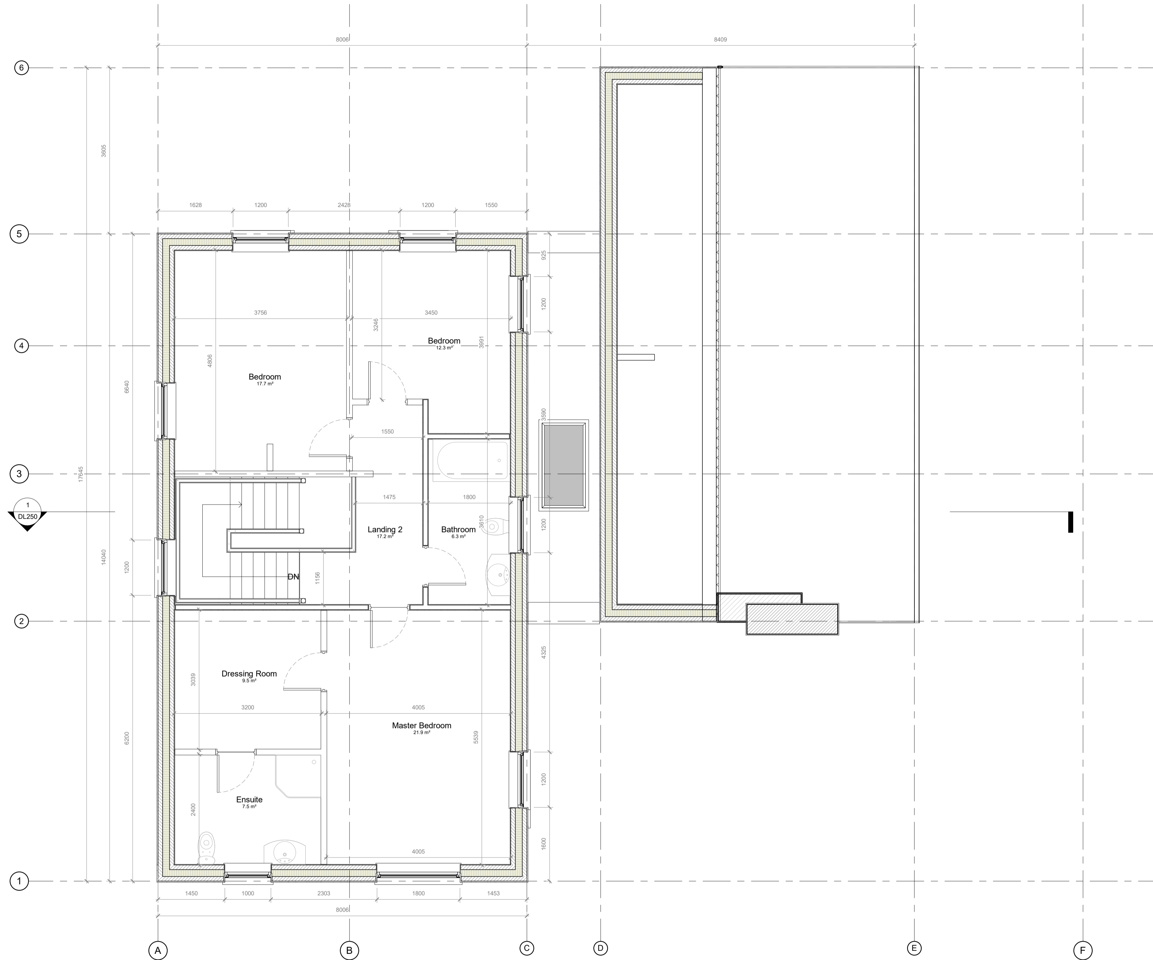
02_1st Floor Plan 1 : 50